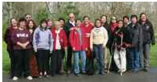
Families of missing and murdered Indigenous women gather in May 2004 for a healing circle hosted by Amnesty International in preparation for the launch of Amnesty International's report, Stolen Sisters: A Human Rights Response to Discrimination and Violence Against Indigenous Women in Canada .

Indigenous women on average earn approximately 30 per cent less than non-Indigenous women. Three quarters of Indigenous families with a single female parent do not earn enough money to meet their daily needs. Indigenous women in Canada are almost three times more likely to contract HIV/AIDS than non-Indigenous women. The life expectancy of Indigenous women in Canada is five to 10 years less than that of non-Indigenous women. The infant mortality rate for Inuit is four times higher than the national average. 12 Although there is little specific data on maternal health among Indigenous communities, it is clear that widespread problems faced by Indigenous communities such as contaminated drinking water and overall poor health lead to increased risks to pregnant women.