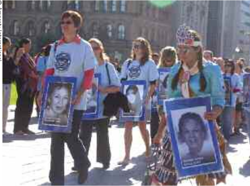
Vigil to honour missing and murdered Indigenous women, Parliament Hill, Ottawa, October 2007.